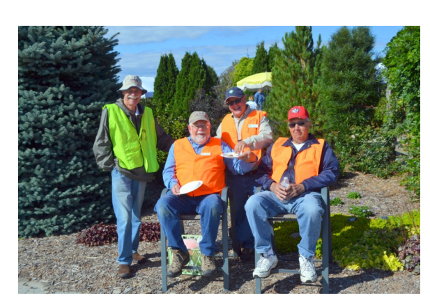
Dear Door County Master Gardeners,

We want to send a special thank you to all of you who helped make the Taste of the Garden Door and Pesto Festo IX a success. The gardens looked wonderful; the Rabbit Patch, Apple tasting, Pesto tasting, Salad and Sides, and Nibble Nook looked great and were easy for folks to get to and move through efficiently. The water station, Heritage info, "Vanna" demonstration of gadgets, Fairy Garden display, tours of PARS, and welcoming faces at the entrance all enhanced the Taste experience. The parking guys reported friendly people going in and coming out and did a great job moving the traffic safely. From "set up" to "take down" we had a great day thanks to all of you!