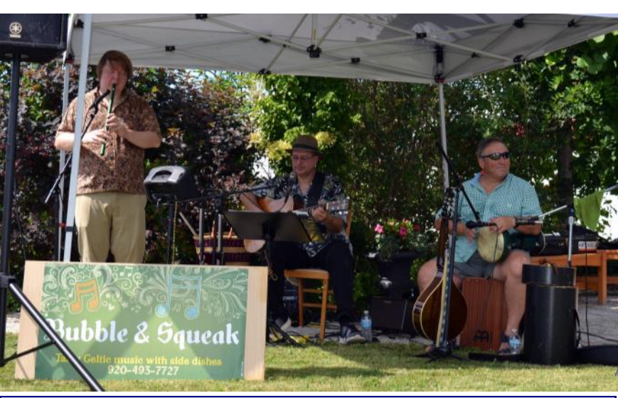
Bubble and Squeak provided eclectic Irish music throughout the Open House.