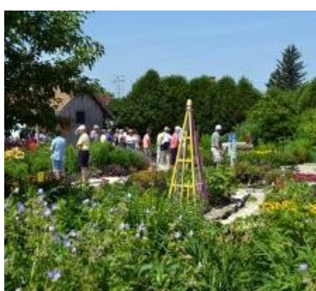
OPEN HOUSE at THE GARDEN DOOR Best it's ever looked!