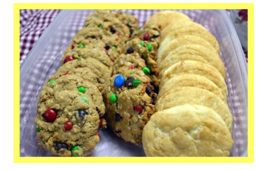
SNACKS! Always a hit!!!