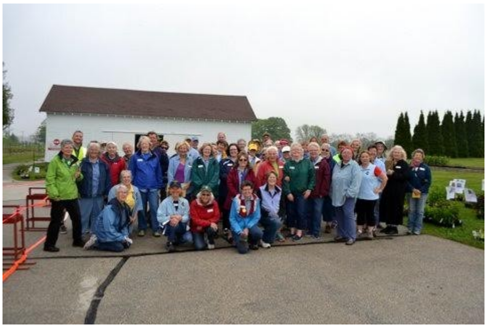
A BIG THANK YOU TO ALL OUR WONDERFUL VOLUNTEERS!